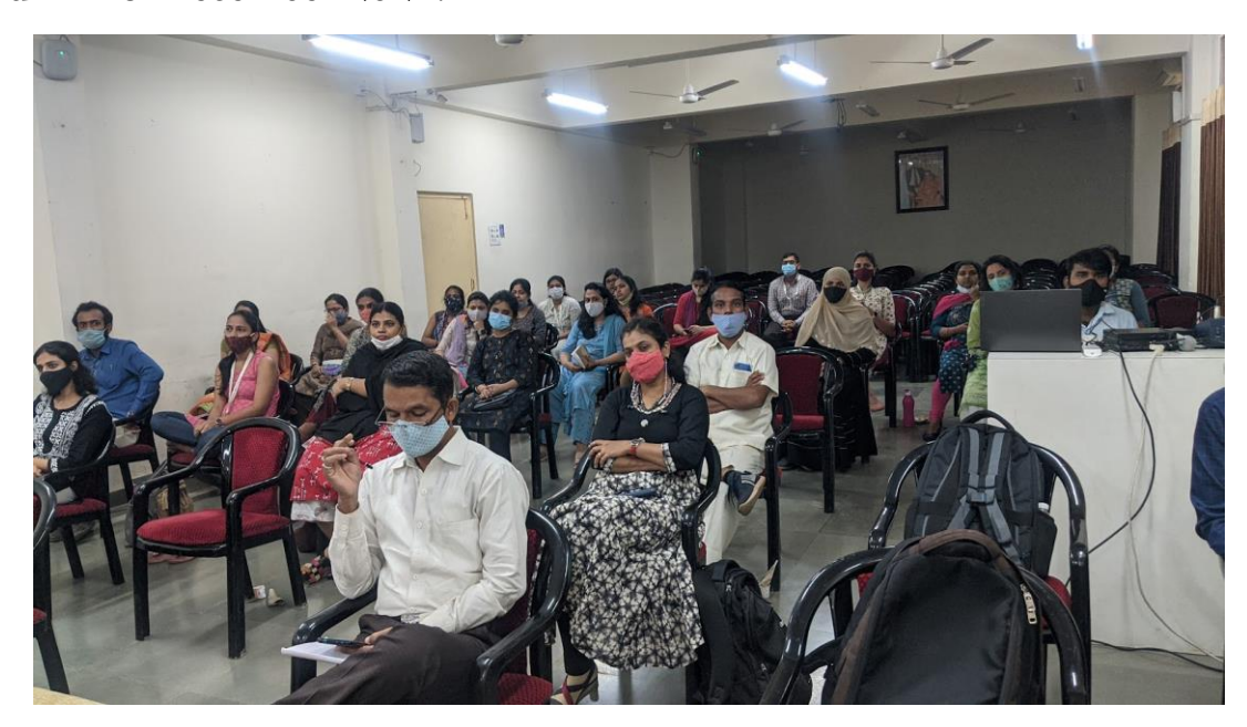
Day1 (13th December 2021)

IQAC Cell of B. K. Birla College conducted an induction program for newly appointed Faculty members. It was a two-day induction program held on 13<sup>th</sup> and 14<sup>th</sup> of December 2021.